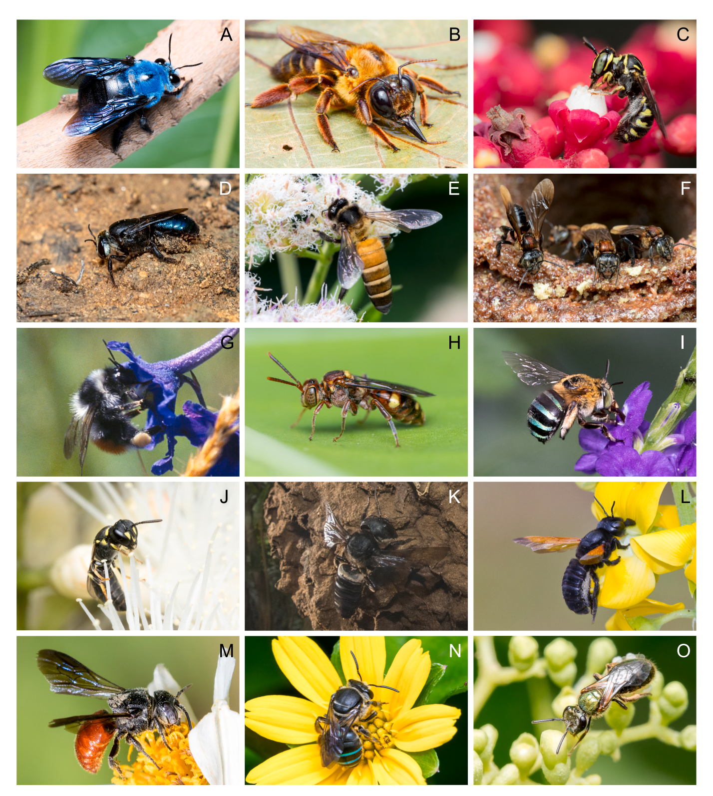
Fig. 1. Asian bee biodiversity. Apidae: A. Xylocopa insularis Smith; B. Xylocopa myops Ritsema; C. Ceratina collusor Cockerell; D. Ctenoplectra chalybea Smith; E. Apis dorsata Fabricius; F. Geniotrigona thoracica (Smith); G. Bombus supremus Morawitz; H. Nomada adusta Smith; and I. Amegilla andrewsi (Cockerell). Colletidae: J. Hylaeus penangensis (Cockerell). Megachile pluto Smith; L. Megachile atrata Smith; and M. Euaspis polynesia Vachal. Halictidae: N. Nomia iridescens Smith and O. Lasioglossum adonidiae (Cockerell).

reduction of pesticide use and pollution of water, light, and air; increase in landscape heterogeneity and semi-natural areas; implementation of pollinator-friendly practices across landscapes; protection and restoration of biodiverse areas and threatened species; and control of alien